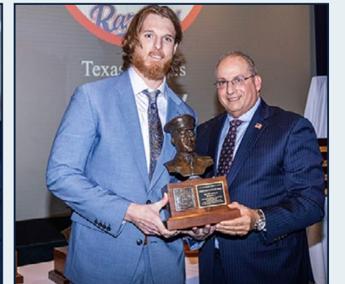
2013 JUSTIN VERLANDER 2014 NICK SWISHER 2015 JONATHAN LUCROY 2016 BRAD ZIEGLER 2017 DARREN O'DAY 2018 SEAN DOOLITTLE 2019 IAN KENNEDY 2020 CRAIG STAMMEN 2021 GRIFFIN JAX 2022 BYRON BUXTON 2023 JON GRAY